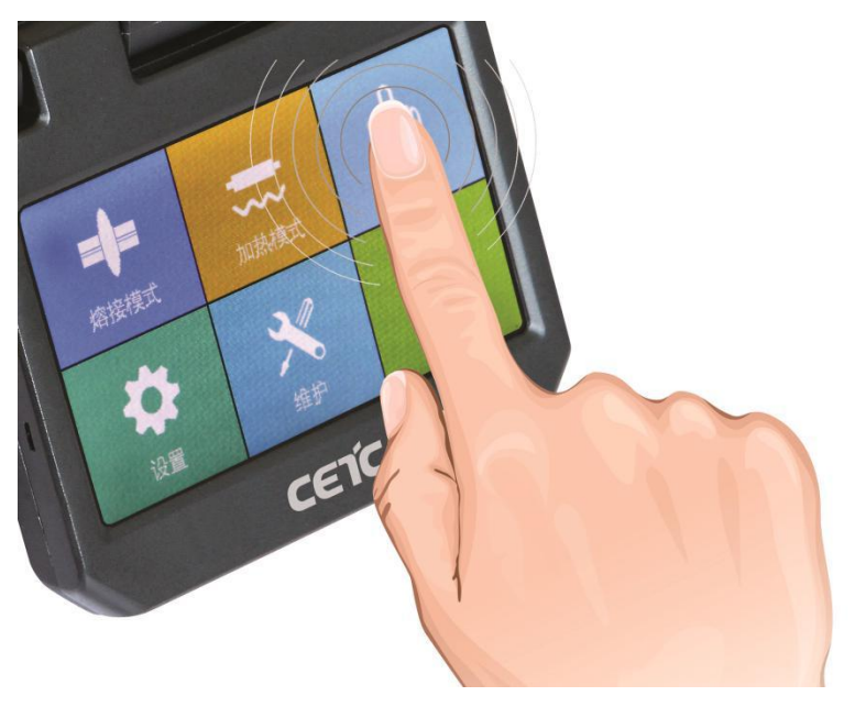
Entirely new GUI graphical interfaces and touch screen

AV6481 uses entirely new GUI and touch screen in design. Operators can set up the splicer and get to know relevant information of it simply and directly by graphical interfaces.