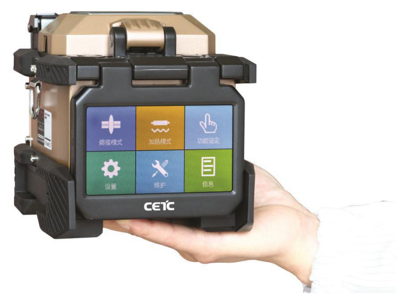
Lift by one hand

Small size and light weight, the splicer is easy to carry and can be lift by one hand.