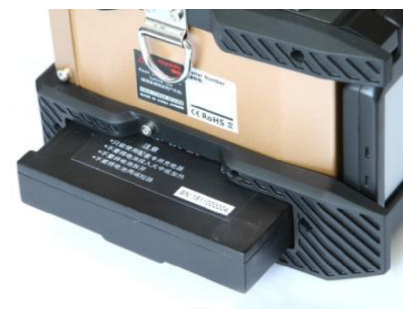
Built-in pluggable lithium battery of large-capacity

The built-in pluggable lithium-ion battery of large capacity can answer working demand lasting all day long (typical 220 counts of splicing and heating cycles).