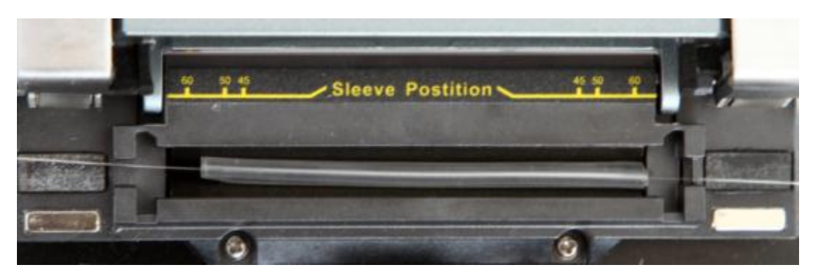
Hear and detection unit

enabled when the protection sleeve is put in the heater, to avoid mishandling.