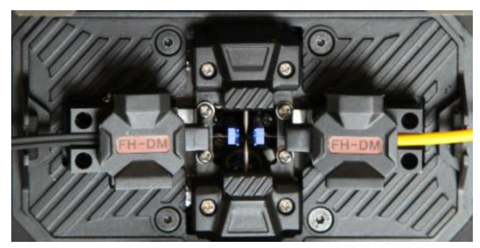
All-in-one optical fiber fixture

The all-in-one fixture meet fusion demands of multiple optical fibers, jumpers and rubber-insulted wires with a cladding diameter of 80\sim150\mu m .